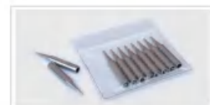
BK900M soldering tip