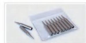
BK900M soldering tip