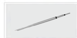
C210 heating core