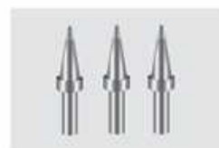
500M soldering iron tip