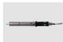
VH300 heating core